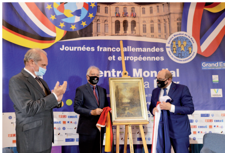
© Centre Mondial de la Paix, des libertés et des droits de l'Homme

Despite all the research carried out by the CIVS and the Mission de recherche et de restitution des biens culturels spoliés entre 1933 et 1945 (Ministry of Culture), the