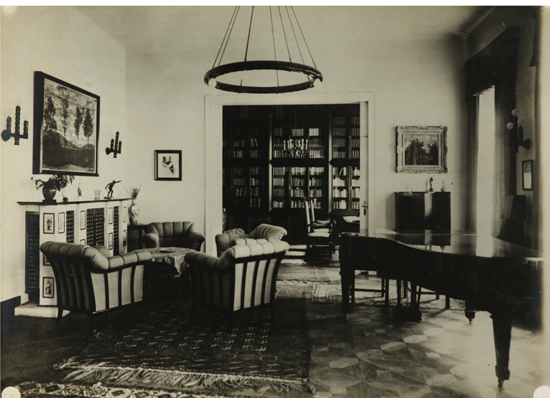
Anonymous, undated photo of the music room in the Morgenstern apartment in Vienna