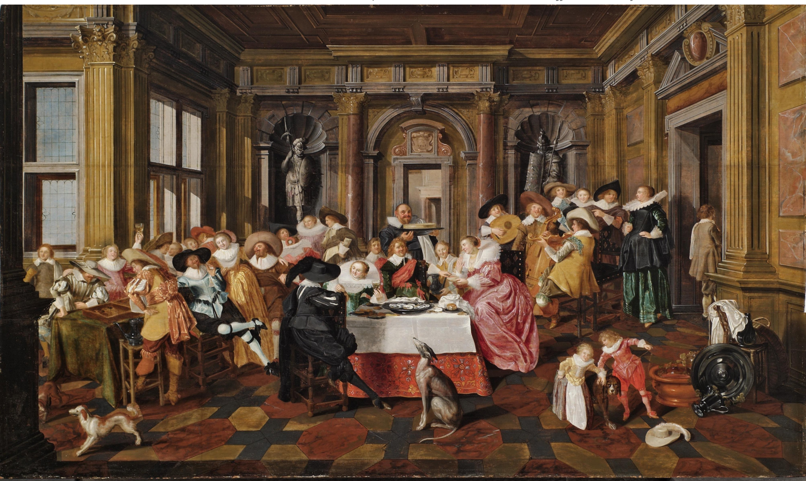
Dirck Franchoisz Hals and Dirck van Delen, "Banquet Scene with Musicians and Shuffle Board Players in an Interior" (1628)

The Dutch Restitutions Committee, referred to below as the DRC, can also advise about claims to artworks from collections other than the NK collection. They can belong to the other holdings of the Dutch State (Dutch National Art Collection) or collections of owners other than the Dutch State, such as local and provincial authorities, foundations or private individuals. A review of the recommendations issued by the DRC in its 162 cases so far shows that the lion's share, namely 128, concerned works from the NK collection. These recommendations related to the restitution of 462 artworks from the NK collection. This proportion is declining however. Of the fifteen cases that the DRC currently has under consideration, only one involves works from the NK collection.