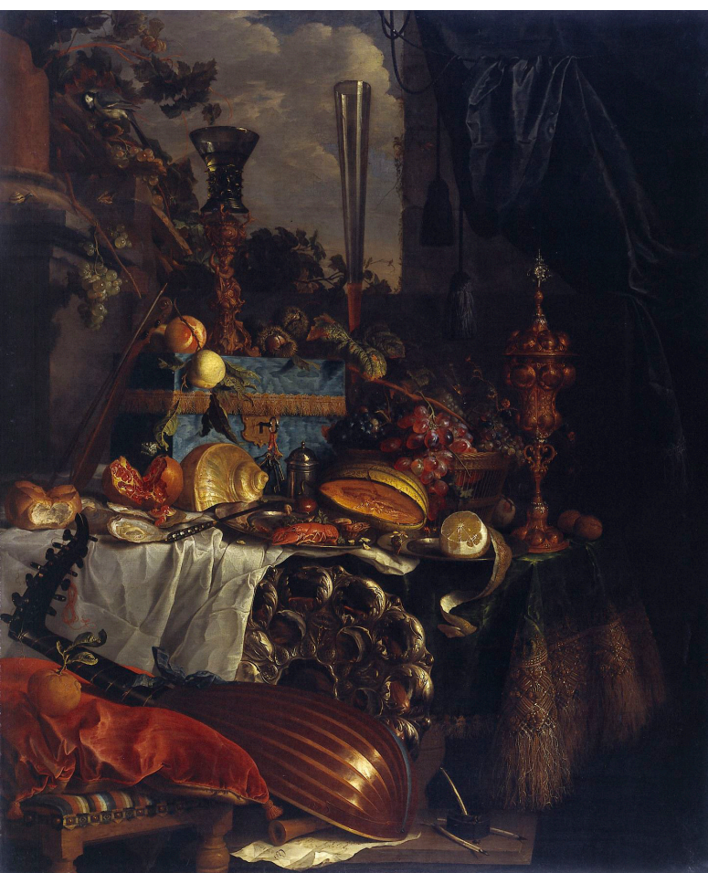
Jan Davidsz. de Heem, "Still Life with Glass, Glass Stand and Musical Instruments" (1665-70)