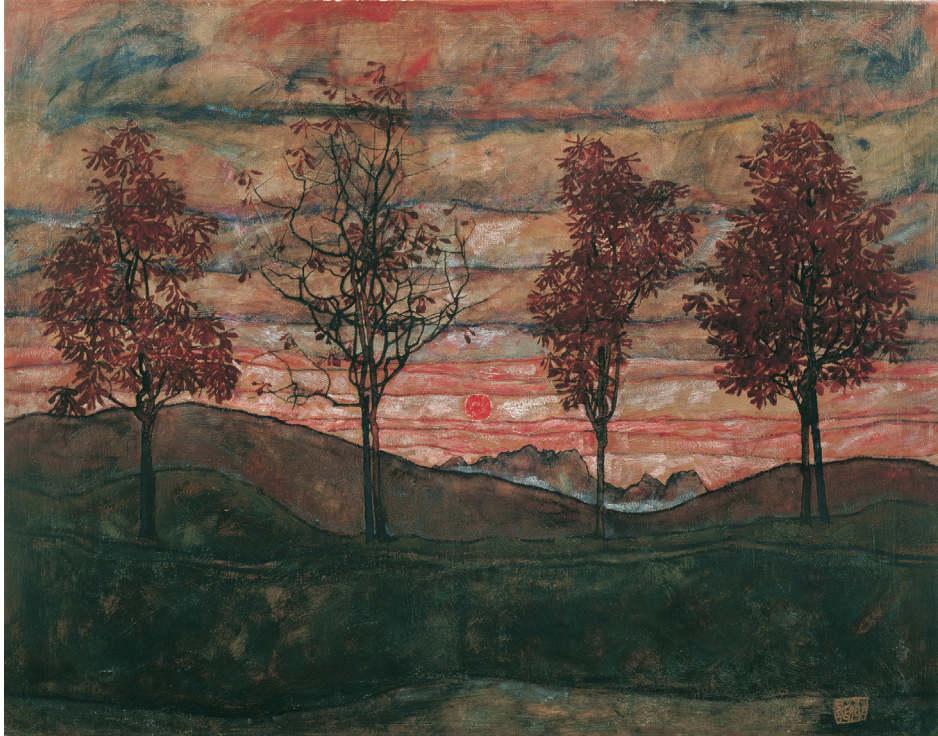
Egon Schiele, "Four Trees/Autumn Allée", 1917